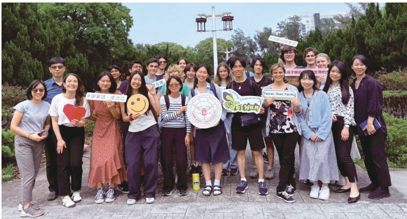
Officials from the American Institute in Taiwan (AIT) took a group photo with Mandarin program students at Lantern Lane.

expressing a strong desire to return to Taiwan to continue learning Mandarin and exploring Taiwanese culture.