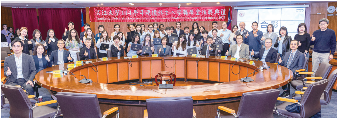
The Office of International and Cross–Strait Affairs held the “2025 Academic Year International Student Entrance Scholarship Award Ceremony” .