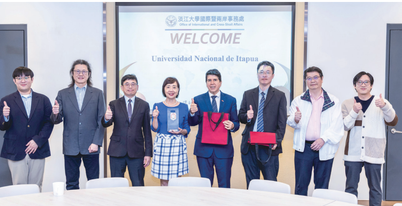
The President of the National University of Itapúa, Paraguay (right 4th) visits Tamkang University.